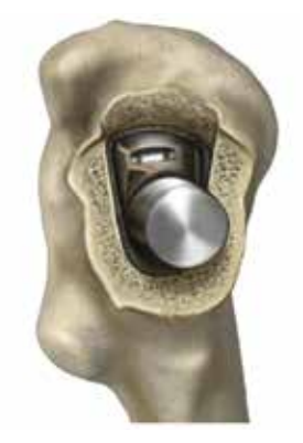
Fig. 3b - Short stem trapezoidal cross-section.