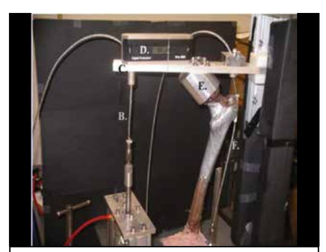
The Dynamic Model Figure: A. Pneumatic Pressure Cylinder B. Body Weight Force C. Aluminium Plate for visual indication of pelvis D. Digital protractor E. Artificial Acetabulum F. Iliotibial band/ abductor muscles (3/16" steelcable).