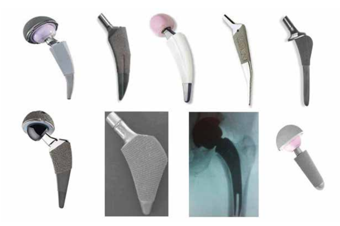
Fig. 2 - Various short and "new" geometry stems recently introduced into the marketplace.

This paper will define a methodology for testing and determining the minimal design characteristics necessary for a short stem implant