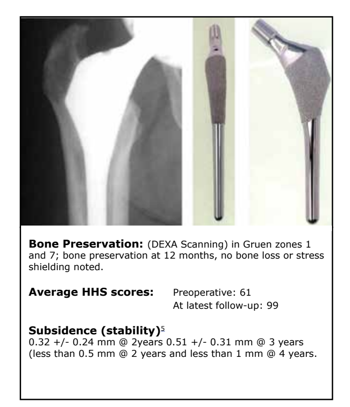
Fig. 4 - Standard length stem. This design utilizes LFIC (Lateral Flare Internal Collar) Technology.

The prostheses ranged in size from 8 to 16.5. Acetabular shells ranged from sizes 44-62mm. Modular acetabular inserts included highly cross-linked polyethylene or metal articulating