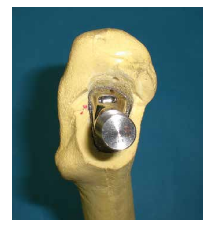
Fig. 3d - Top view surgical technique.

was employed to evaluate the consequences of reduction of the standard stem length on the distribution of load within the femur<sup>7</sup>.