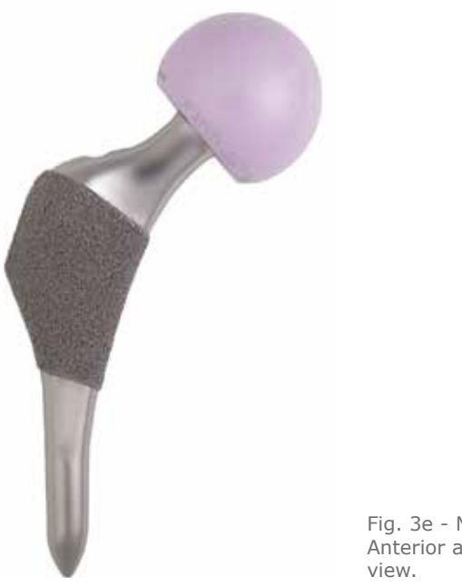
Fig. 3e - MicroMax Anterior and lateral

There were 80 males and 120 females. They ranged in age from 36-90 years.