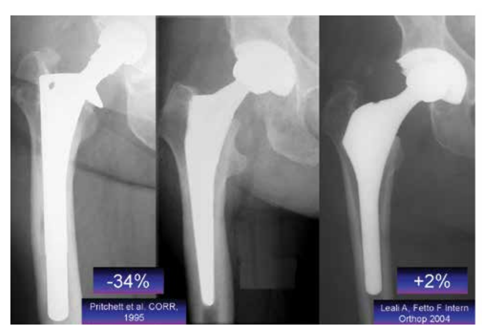
Fig. 6 - Wolff's Law in action: post-operative changes in femoral bone morphology and quantity.

As reported by Arno et al.<sup>7</sup>, shortening of the standard stem length "lateral flare" femoral